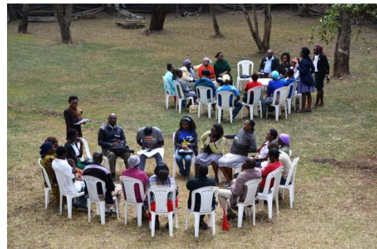
Workshops in the garden about "marketing for small businesses" or "expanding your business"