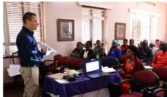
Our Business Forum covered topics like "Be your brand!" or "Doing business God's way"