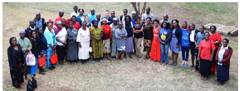
Business Forum Group photo

Do you want to sponsor a child? See details on www.RealStarsKenya.com or email us: real.starskenya@gmail.com